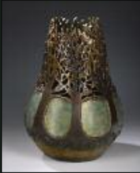
Scottsdale Fine Art Carol Alleman Bronze edition of 35