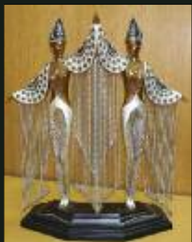
Esses Rare Objects Erté Bronze Sculpture