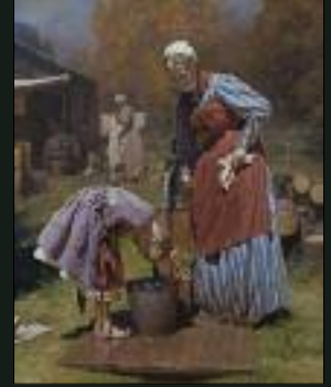
Biltmore Galleries Benjamin Wu Oil on Canvas

3908 Scottsdale Road, 480-990-1200, www.americanfineartgallery.com