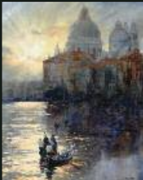
The Shorr Gallery Alan Wolton Oil on Canvas