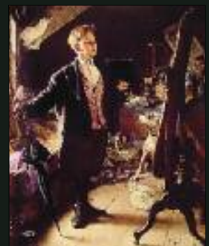
American Fine Art Editions Norman Rockwell