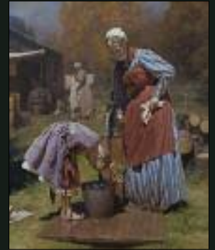
Biltmore Galleries Benjamin Wu Oil on Canvas