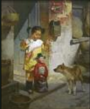
Trailside Galleries Jie Wei Zhou Oil on Canvas