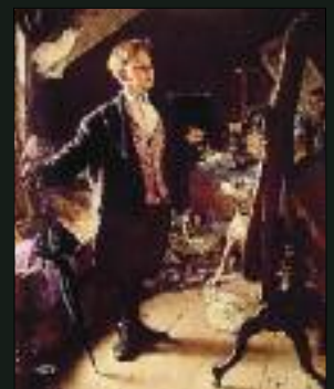
American Fine Art Editions Norman Rockwell