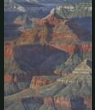
Amery Bohling Fine Art Amery Bohling Oil on Canvas