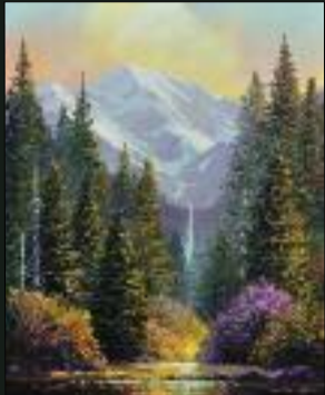
The Signature Gallery Charles H. Pabst Oil on Canvas