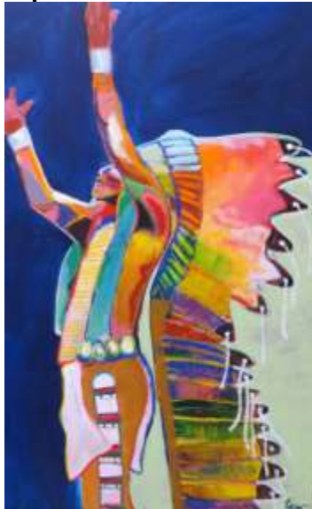
"Calling the Great Spirit II" Reception March 5th, 7 to 9 pm. Artist Show extends through April 30th.