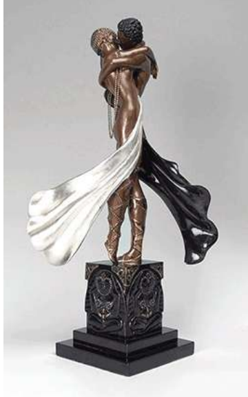
“Lovers and Idol” by Erte

Specializing in 19 th Century European and Asian antiques and objects d’ art, art deco sculptures and European fine art.