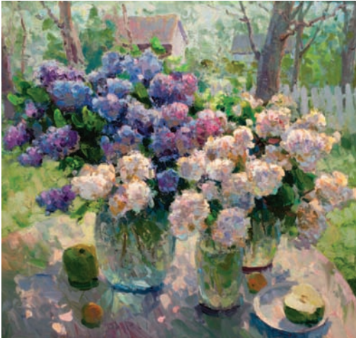
Gregory Packard, Lilacs Outside Oil on panel, 30" x 34"