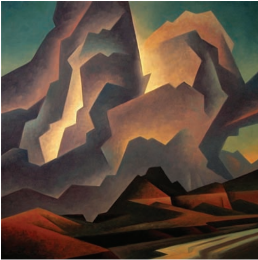
Ed Mell, Pinnacle Storm Oil on canvas, 22" x 22"