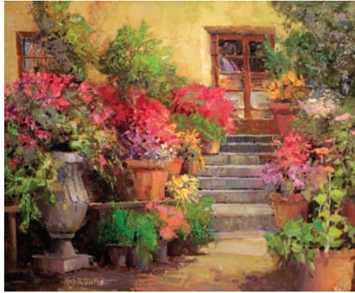
Kent R. Wallis, Impressive Entryway