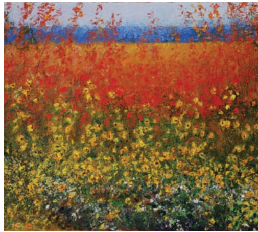
Gary Ernest Smith, Wild Flowers Oil on canvas, 24" x 30"