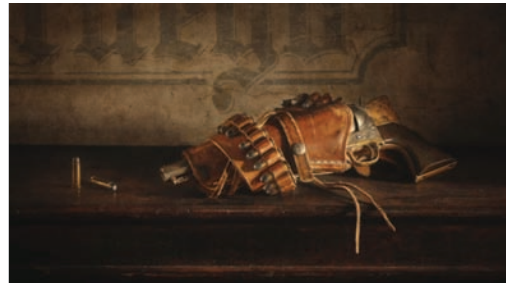
Kyle Polzin, El Pistolero Oil, 14" x 24"