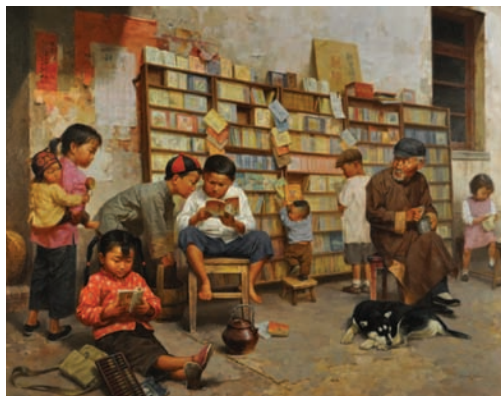
Jie Wei Zhou, Street Library Oil, 36" x 48"

Trailside Galleries was established in 1963 in Jackson, Wyoming and opened a second location in Scottsdale, Arizona in 1975. Today, it is collector's first choice for the finest in representational works of art. The gallery regularly features a superb collection of western, impressionist, landscape, figurative, still-life and wildlife art as well as works by deceased masters. Trailside's 5500 square foot gallery is located in the Scottsdale Civic Center Plaza along the picturesque boulevard at the center of Old Town Scottsdale's scenic downtown park area.