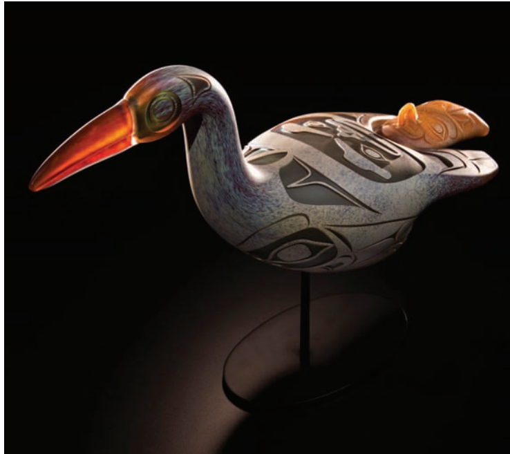
Preston Singletary, Loon Rattle