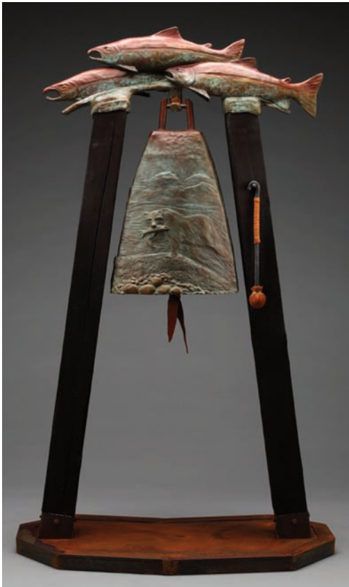
James G. Moore, Bountiful River Bronze, Edition of 20, 69" x 38" x 22"