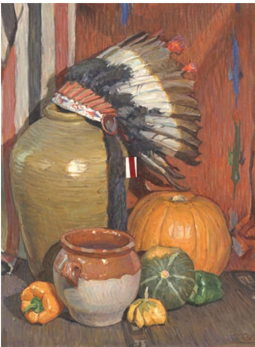
Tim Solliday, Autumn Stillife Oil, 24" x 20"