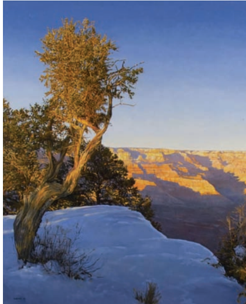
Peter Holbrook, Pinon at Trail View Oil on canvas, 48" x 40"