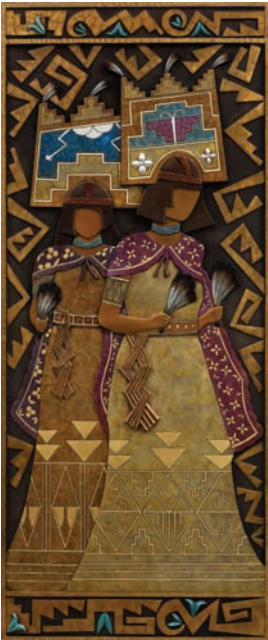
Tammy García, Panshara Bronze with patinas, 65-1/2" x 27-1/2"