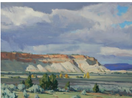
G. Russell Case, Oil on board, 12" x 16"