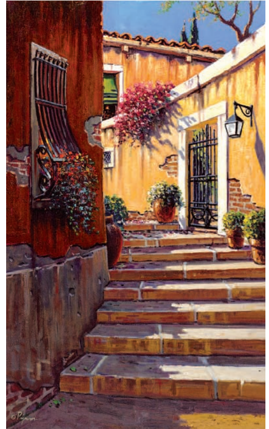
Bob Pejman, Ischia Village Oil on canvas, 48" x 30"