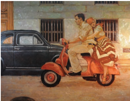
Joseph Lorusso, Andiamo Oil on panel, 35" x 45"