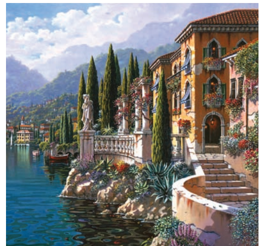
Bob Pejman, Morning Reflections Oil on canvas, 30" x 40"

7165 East Main Street Scottsdale, Arizona 85251