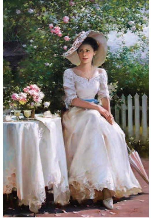
An He, A Moment in the Garden Oil on canvas 40" x 30"