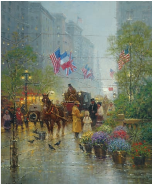
G. Harvey, Land of Faith and Freedom Oil, 30" x 24"