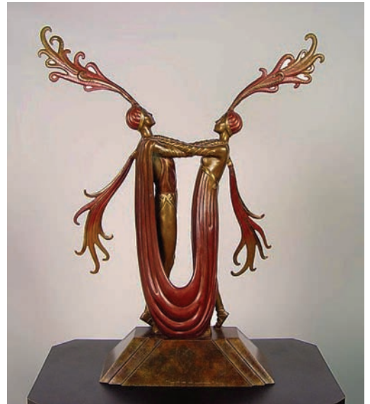
Erte, Kiss of Fire