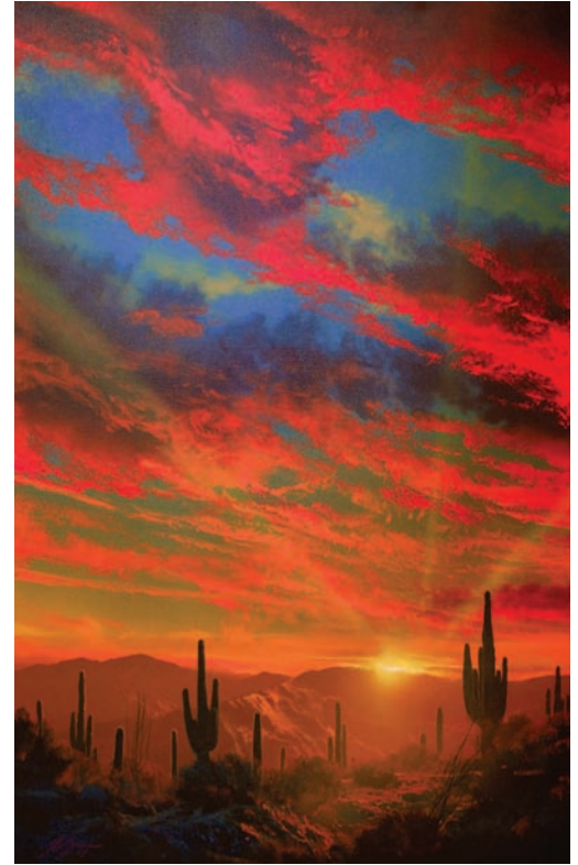
Dale Terbush, Shall We Wait In Twilight